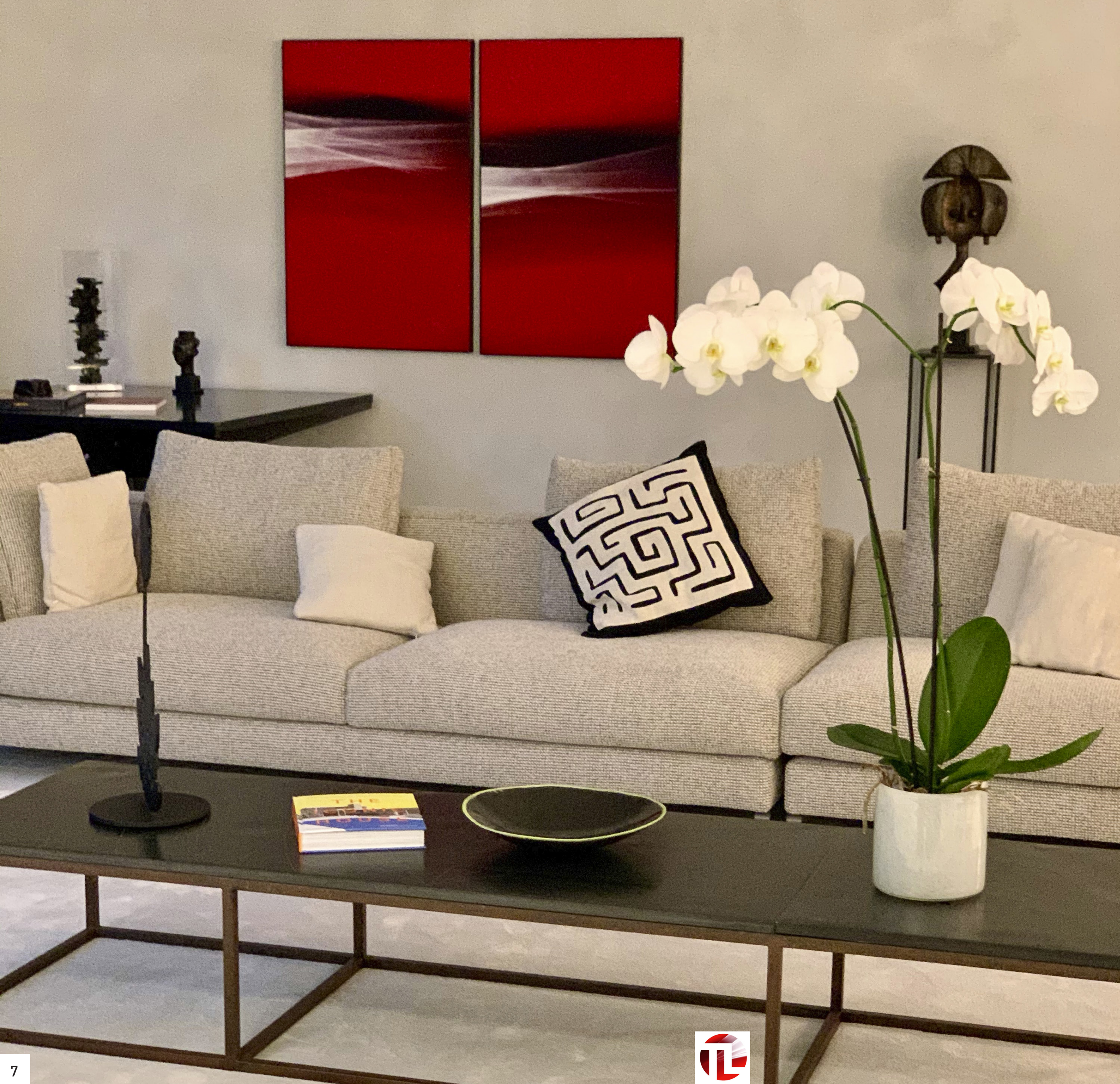
Private house, Brussels.