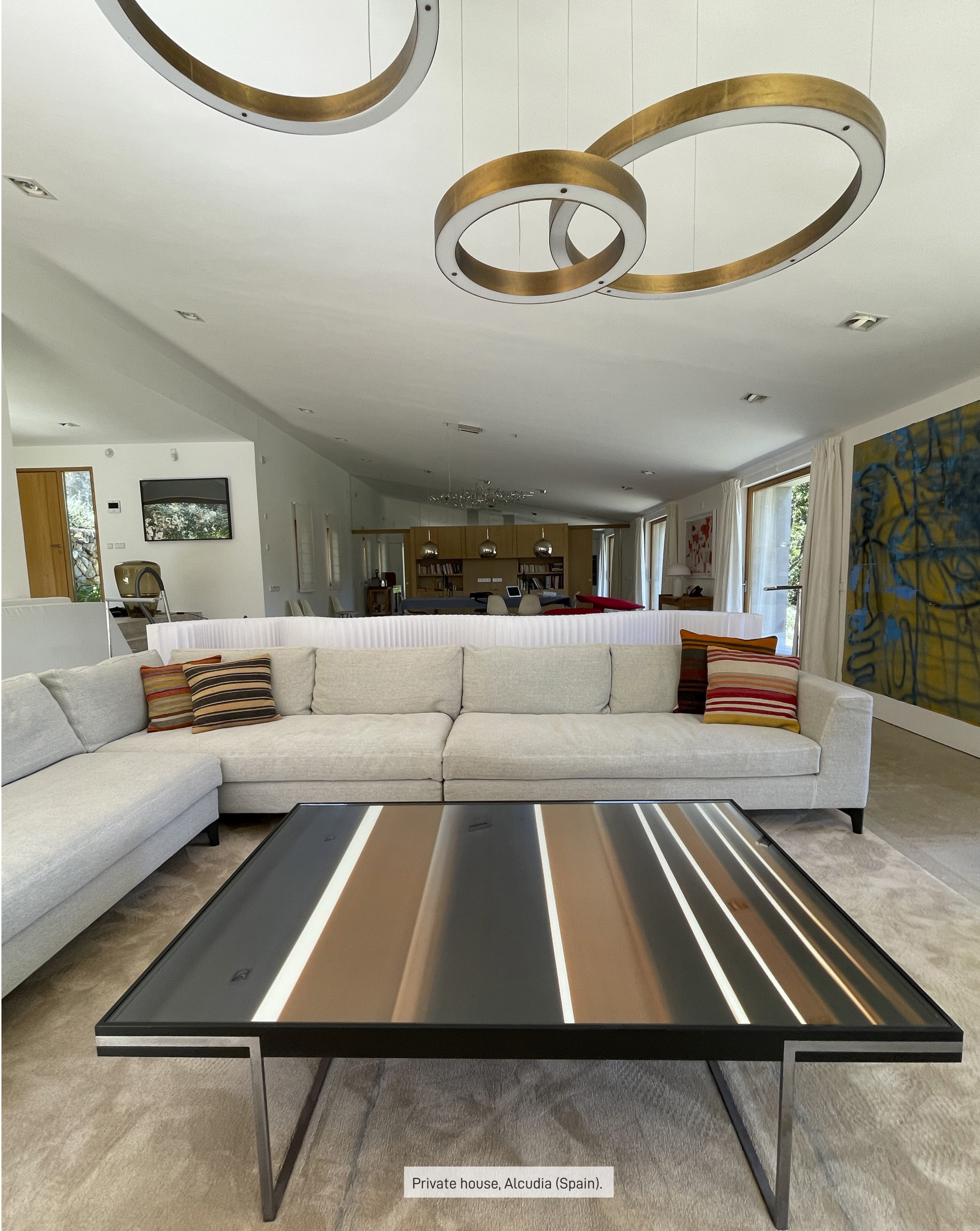
Private house, Alcudia (Spain).