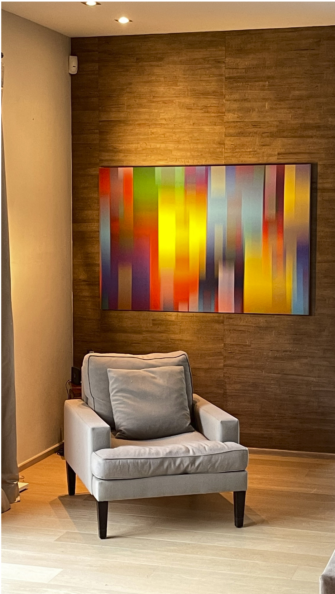
Private house, Waterloo.