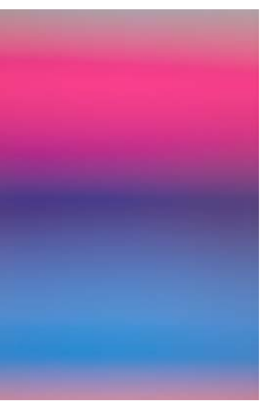
Coloured Meditation #3