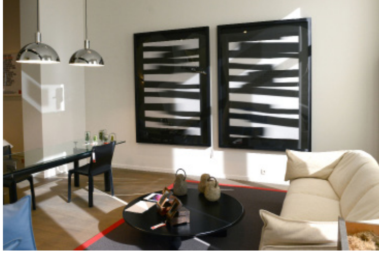
Black and White Rhapsody #1 & #2