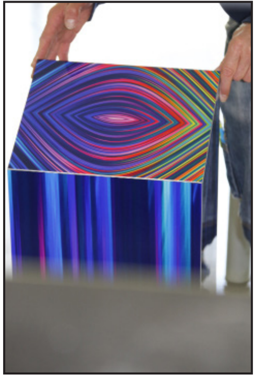
The symbolic eye of God on the top of the Triple Pi column

Actually, the reversible character of these works fully expresses their duality: