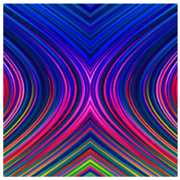
The "X" representing the anonymous man at the bottom of the Triple Pi column

- When more vivid colours are upwards, the column has a descending character and Man tends to anchor on Earth. The top of the column represents a kind of stylish "X" representing the anonymous man, a kind of lambda man.