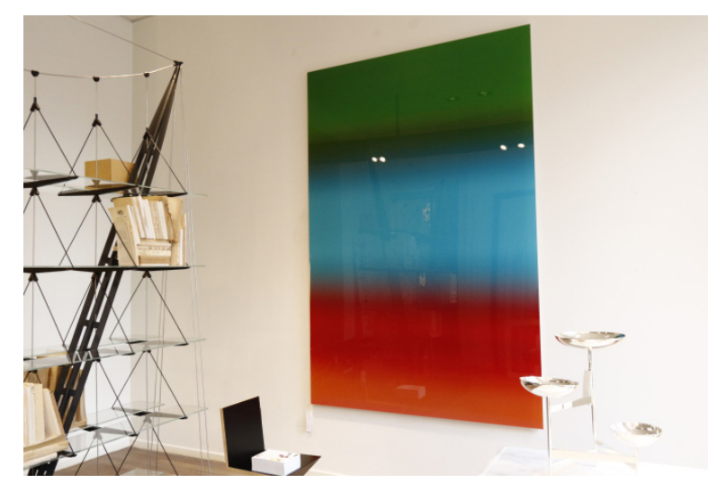
Coloured Meditation #2 (the invitation)