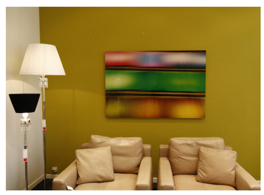
Coloured Inspiration #3

Dominique Rigo - Cassina Showroom Avenue Louise 154 B-1000 Brussels www.dominiquerigo.be