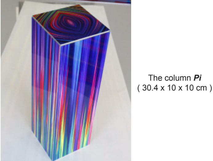
A contemporary version of the totem with a strong symbolic meaning

The smallest of the two, Pi (30.4 x 10 x 10 cm - edition of 10 + 2 AP) is designed to be placed on a low table or an office desk. The medium format, Triple Pi (94.2 x 30 x 30 cm - edition of 5 + 2 AP) is an elegant sculpture for interior use. Those two new sculptures are clearly related to my work on colour.