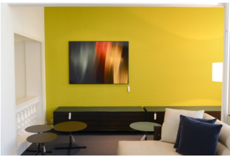
Light Veils #2